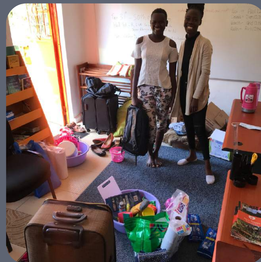
Packing for university