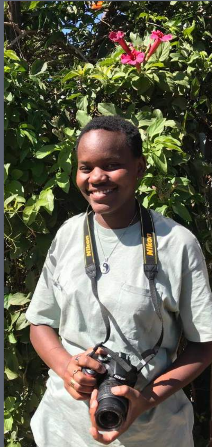
Polishing camera skills

For her personal project, she went back to her village and did a series of interviews on various taboo topics and how they are affecting her community. She has published some of these videos on YouTube. One of the videos is 'Surviving Illegally' which brings to light the stories of women brewing illicit liquor in her village.