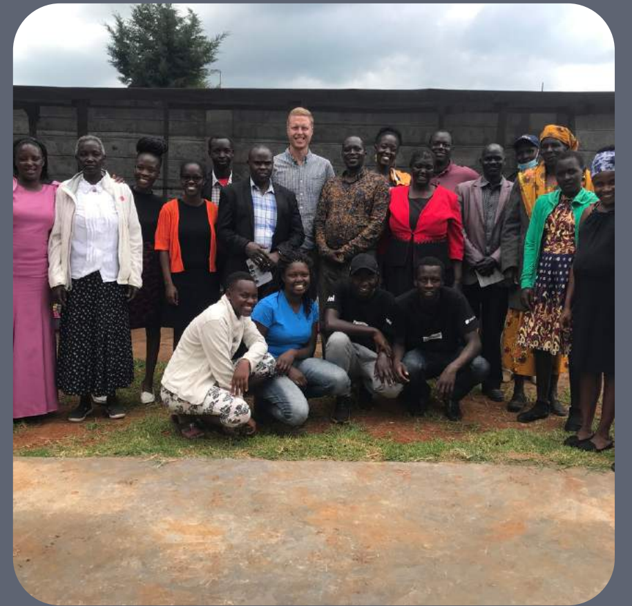
Celebration before joining uni