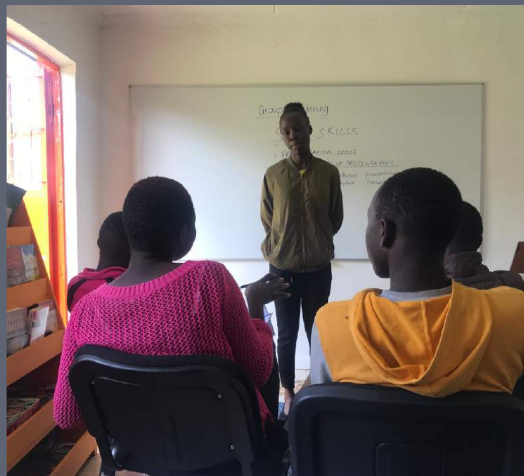
Ongoing Soft Skills Lessons