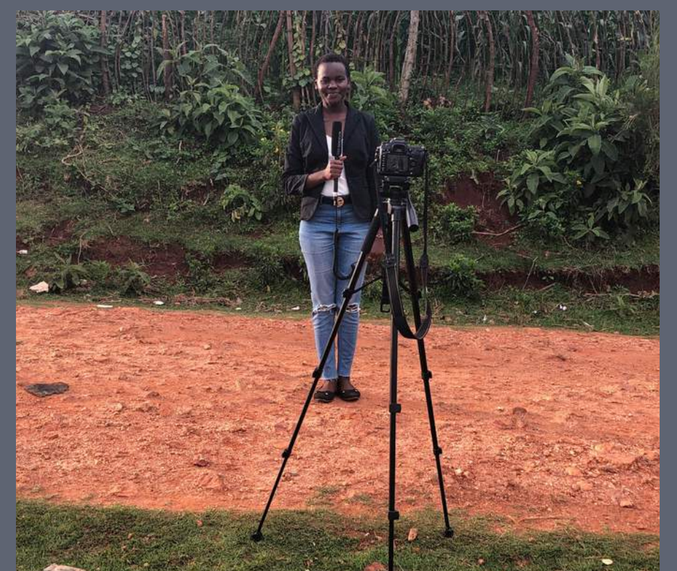
Shooting a video for her personal project