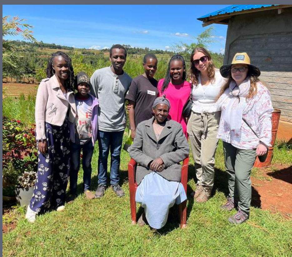
Visit to Ruth's home