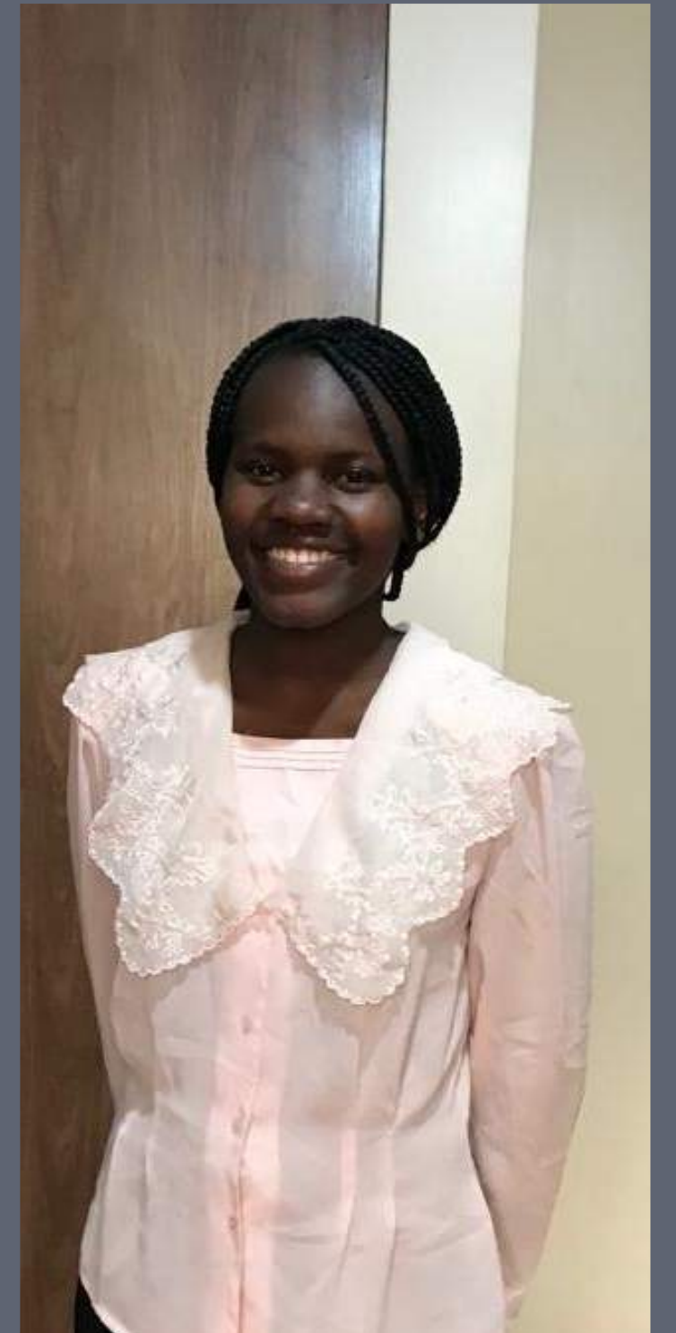
Dressed up for internship