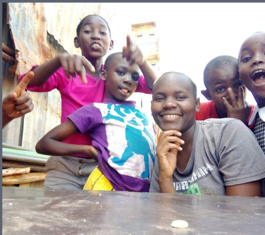
At the children's home