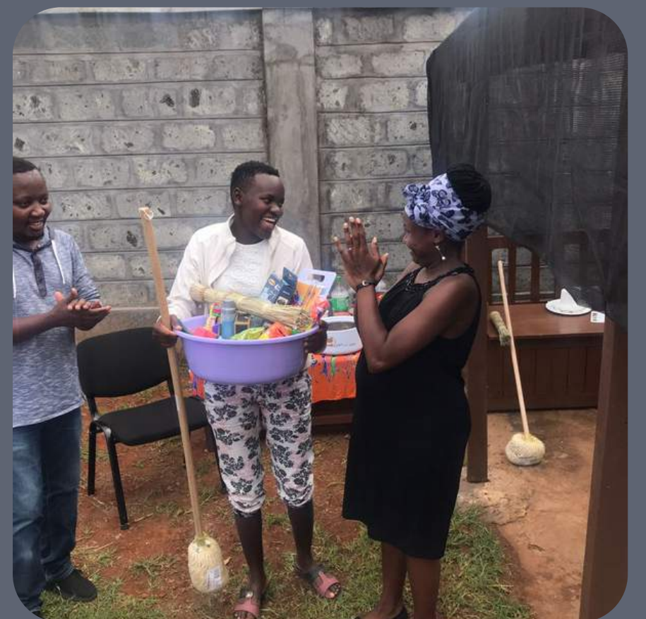
Celebration before joining uni