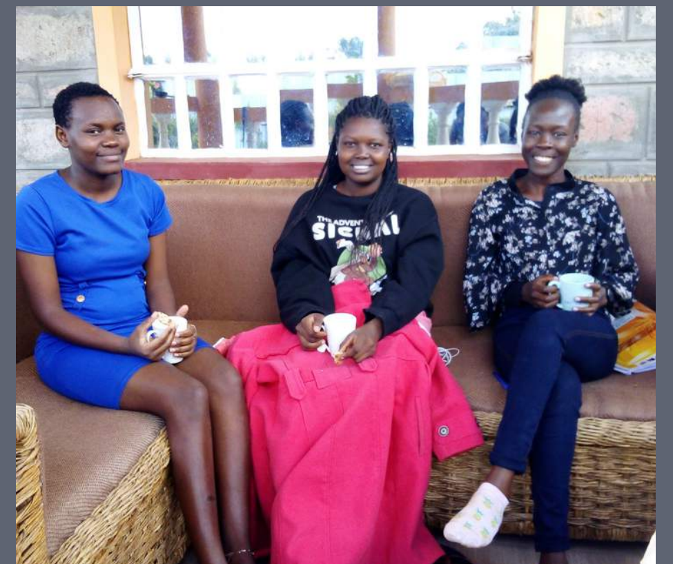
Mentorship with Mercy