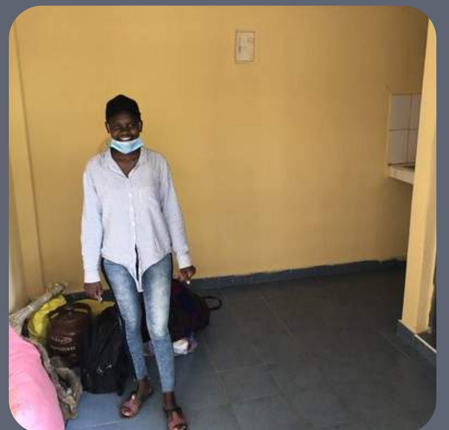
First day at uni accommodation