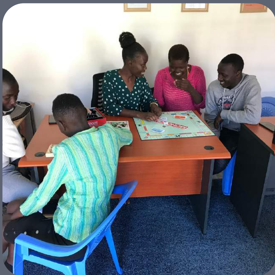
Learning to play monopoly