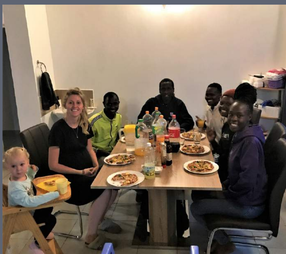
Dinner with everyone during the holidays