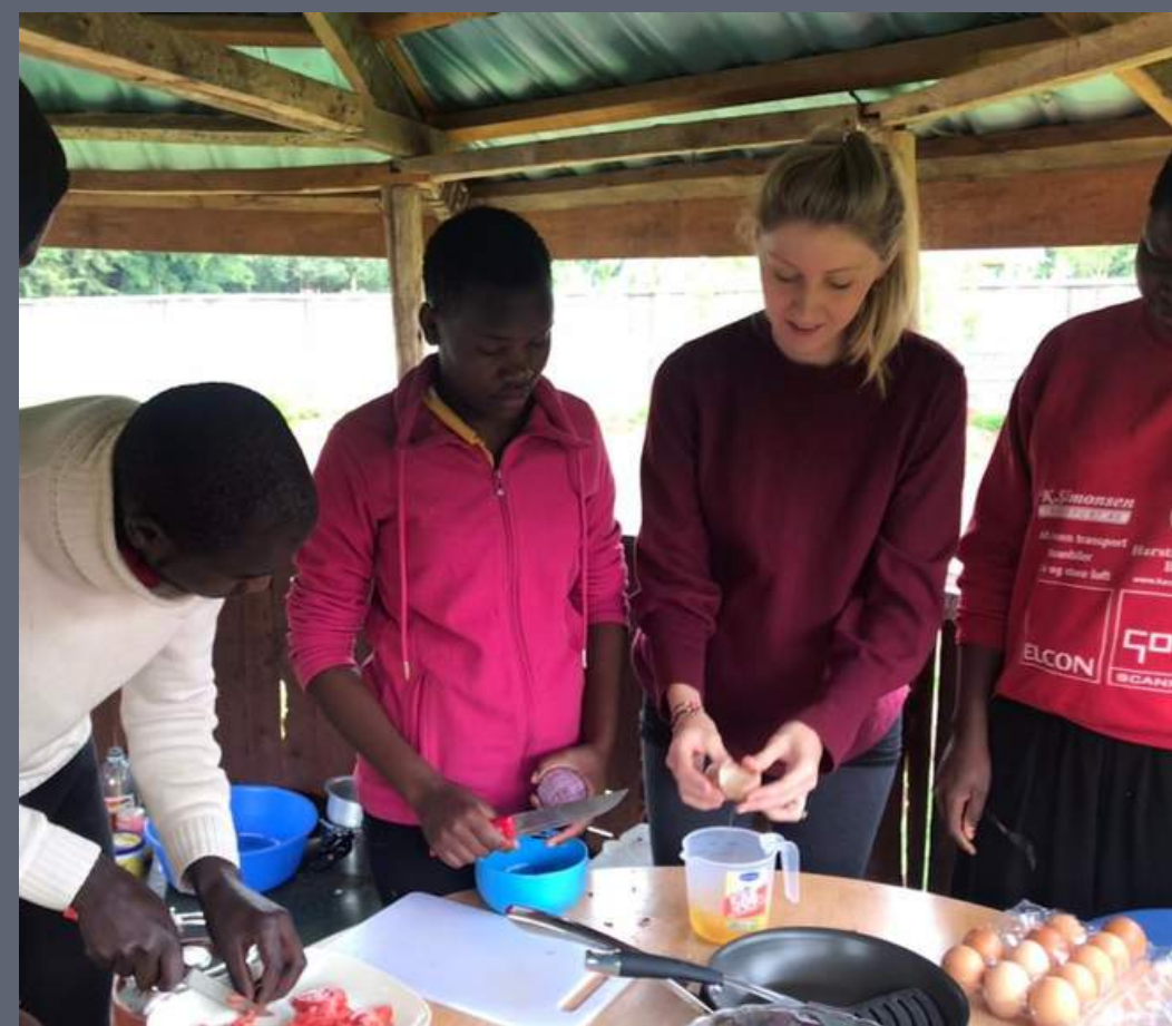
Health & Wellbeing Application Day